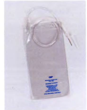
Sample Collection Bag