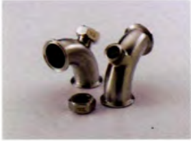
Tri-Clamp Elbows (316L)