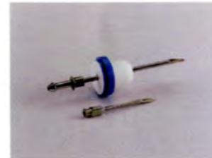
Aseptic Probe Septum

Aseptically place temperature probes, pH probes, oxygen sensing probes and other similar products that measure various perimeters for processing 110031