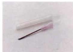
Needles 14g - 113314 16g - 113316 18g - 113318 20g - 113320 22g - 113322 23g - 113323