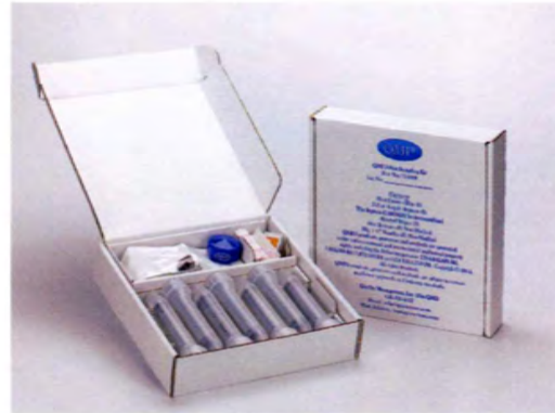
Sampling Kit 114018