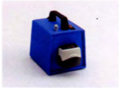
Portable Peristaltic Pump 411720