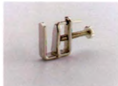
Flow Control Clamp 112010