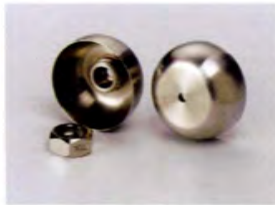
Insulated Tank Fittings (316L)