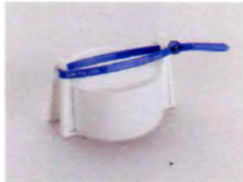
Tamper Evident Device 310021 Blue Numbered Tie Strap 310020