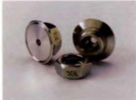
Tri-Clamp End Caps (316L)