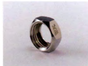
Stainless Replacement Nut 219021