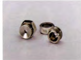
Tank Fitting (316L) 212113