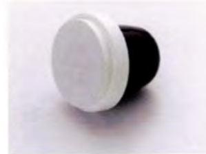
Aseptic Septum 110011

The QMI Septa are equipped with 7 individual needle guide channels. Pierce each channel once with a needle to withdraw a sterile sample. Once all channels have been used, the septa should be replaced. These septa fit inside the QMI stainless steel 7-Port fittings. Standard Operating Procedures can be found on our website at www.qmisystems.com