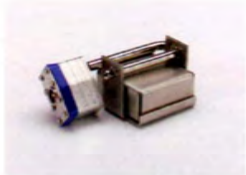
Stainless Locking Device 310031