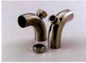
Weld Elbows (316L)