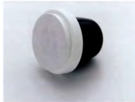
QMI Aseptic Septum

For direct load and string sampling, we recommend sampling from an elbow which provides good turbulent flow and allows for the collection of a representative sample. The QMI elbow can easily be retrofitted at your existing tri-clamp location and is CIP cleanable.