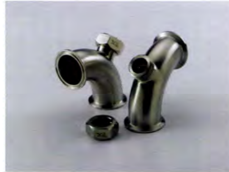
QMI Tri-Clamp Elbows

A QMI fitting may be welded on the side of a bulk tank or on the manway door of a silo. Installation instructions are available on our website.