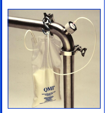
QMI Composite Sampling Bag (part number 2392)