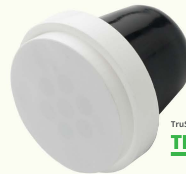
TruStream7 Septa #110011