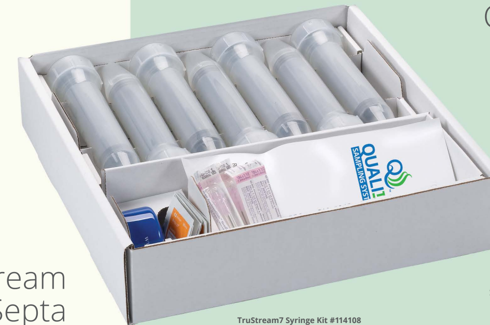
TruStream7 Syringe Kit #114108