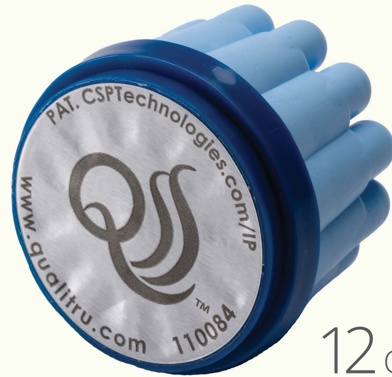
TruStream12 Septa #110084